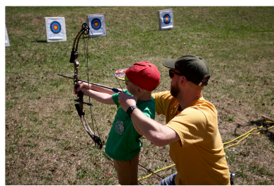
Father/Son Archery on a Beautiful Spring Day

For myself personally, this was one of my favourite FSTD events. The extra helpers meant I didn't have to run many events myself, I was able to oversee and mingle and chat with the boys and dads. I loved it!